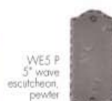
WE5 P 5" wave escutcheon, pewter