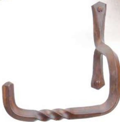
Toilet paper holder

TPH SF DM R split foot, diamond bar, rust (with twist)