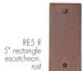
RES R 5" rectangle escutcheon, rust

split foot, square bar, black (specify with or without twist) also available in 24" and 30"