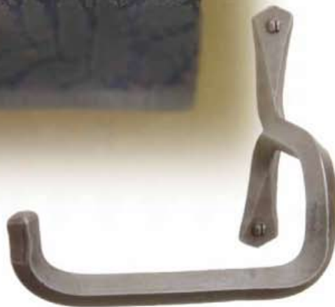
Toilet paper holder

TR SF DM P split foot, diamond bar, pewter (without twist)