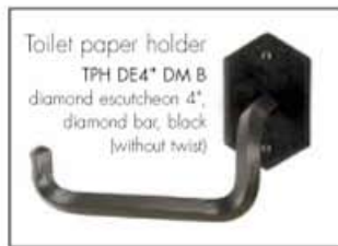
Toilet paper holder TPH DE4* DM B diamond escutcheon 4", diamond bar, black (without twist)