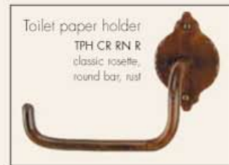
Toilet paper holder

TPH SF RN B split foot, round bar, black