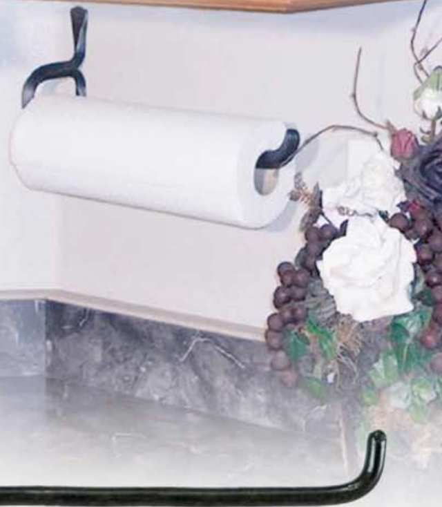
PTH SF RN B split foot, round bar, black