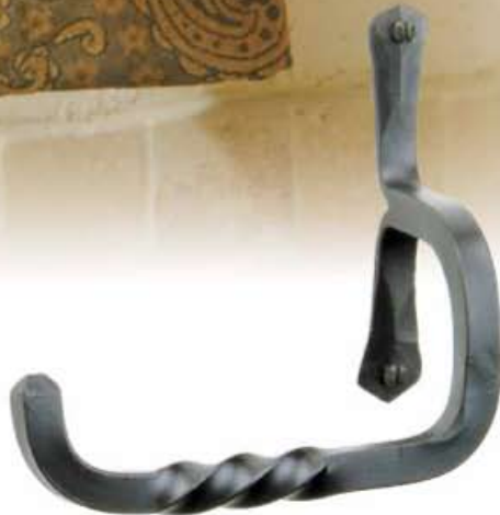
Toilet paper holder

split foot, square bar, black (specify with or without twist)