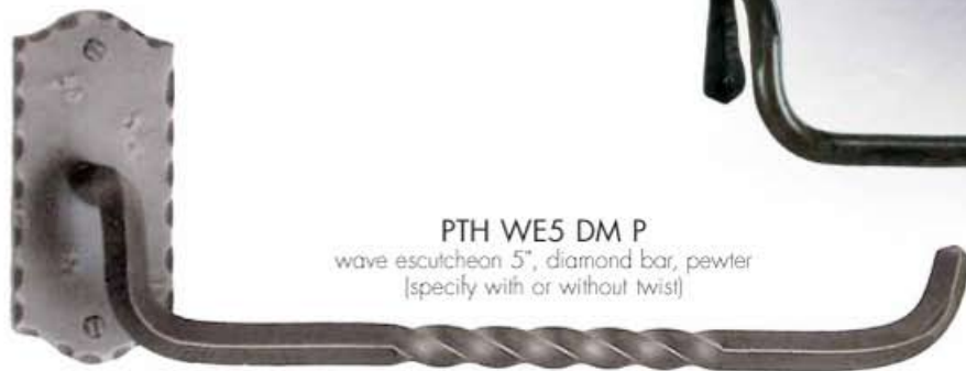
PTH WE5 DM P wave escutcheon 5", diamond bar, pewter (specify with or without twist)