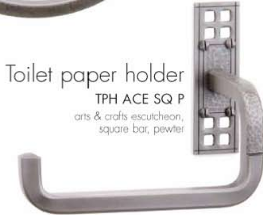
Toilet paper holder

TR ACE SQ P arts & crafts escutcheon, square bar, pewter