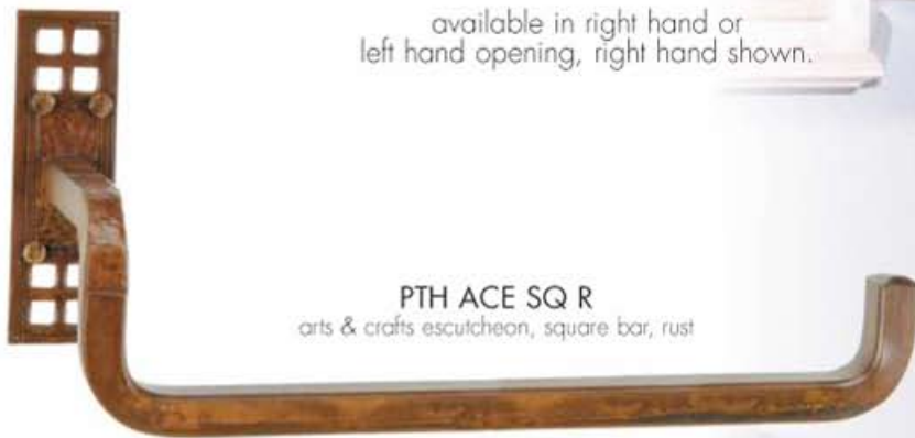
PTH ACE SQ R arts & crafts escutcheon, square bar, rust

available in right hand or left hand opening, right hand shown.