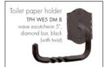
Toilet paper holder TPH WES DM B wave escutcheon 5", diamond bar, black (with twist)