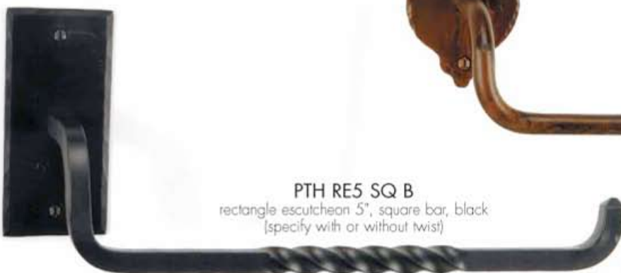
PTH RE5 SQ B rectangle escutcheon 5", square bar, black (specify with or without twist)