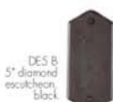
DES B 5" diamond escutcheon, black