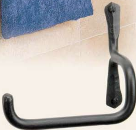
Toilet paper holder

TPH SF RN B split foot, round bar, black