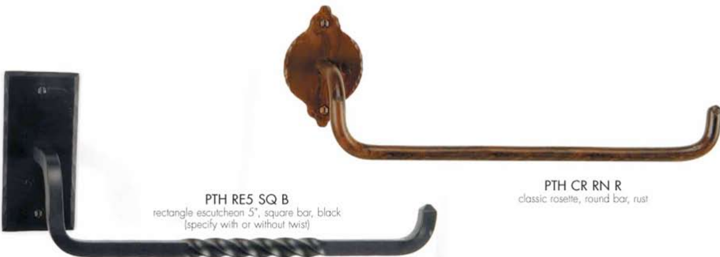
PTH CR RN R classic rosette, round bar, rust