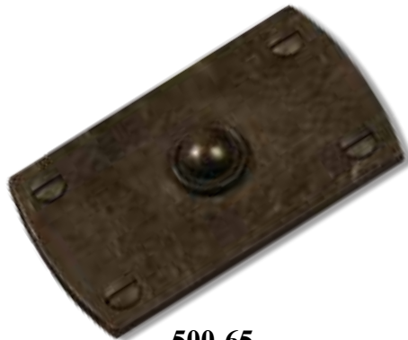
500-65 Arched Door Bell 2" x 3-1/2"