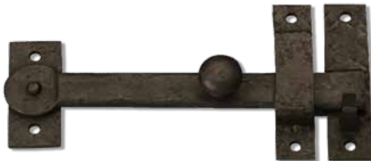
50-125 Drop Bar no Knob Bar 7-1/2" Catch Plate 3-3/4" x 1"