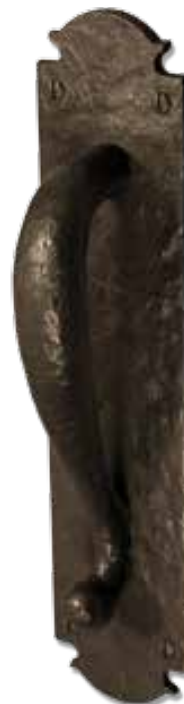
325-95-PUL Cobra Pull on Euro Plate 12" x 2-3/4"