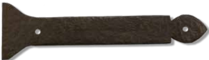
20-413 Non Active Band Hinge

20-105 Non Active Strap Hinge 5" x 1-1/2"