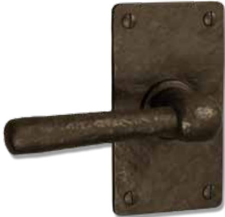
100-20-PAS Square Passage Set 5" x 2-3/4"