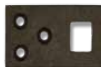
90-114 - Universal Plate For 4" & 6-1/2" Slide Bolt