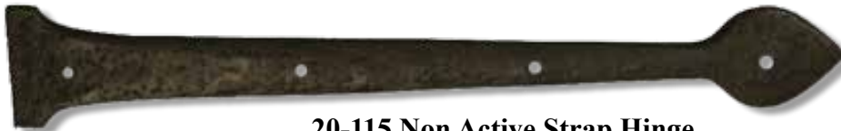
20-115 Non Active Strap Hinge