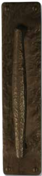
125-90-PUL Bar Pull on Square Plate 12" x 2-3/4"