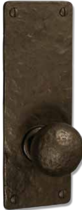
110-70-PAS Square Passage Set 8" x 2-3/4"