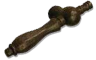
40-Octagonal 6" Lever 3" Proj.