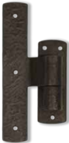
70-620 - 1-1/4" Offset 70-625 - 2-1/4" Offset T-Hinges