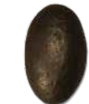
60-Oval Knob 2-1/2" x 1-1/2" 2-3/4" Proj.