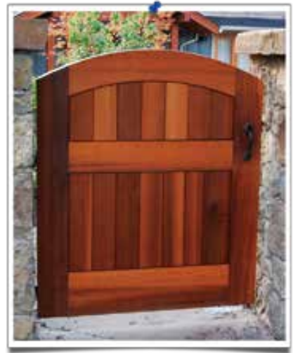
40-310 Thumb Latch 10" Long 2-1/4" Wide