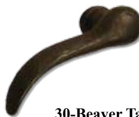
30-Beaver Tail 4-1/2" Lever 2-1/4" Proj.