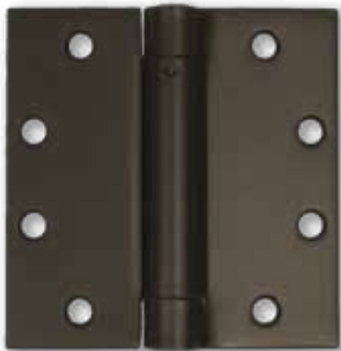
30-450 Spring Hinge