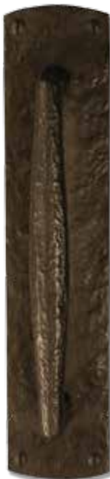
225-90-PUL Bar Pull on Arch Plate 12" x 2-3/4"