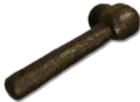
20-Round 4-3/4" Lever 2-1/4" Proj.