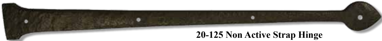
20-125 Non Active Strap Hinge