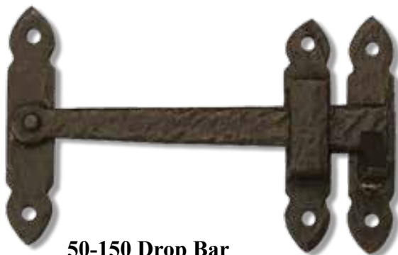
50-150 Drop Bar Bar 6-1/2" Catch Plate 4" x 3/4"