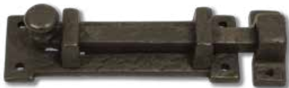
90-200 - Surface Slide Bolt 4" x 1-1/2"