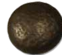
75-Large Mushroom Knob 2-1/4" x 2-1/2" Proj.