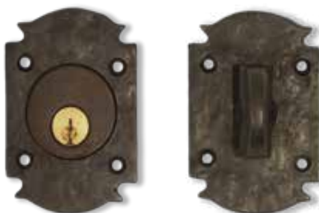
30-275 Patio Deadbolt Euro 30-252 Patio Bolt Euro 2" x 3"