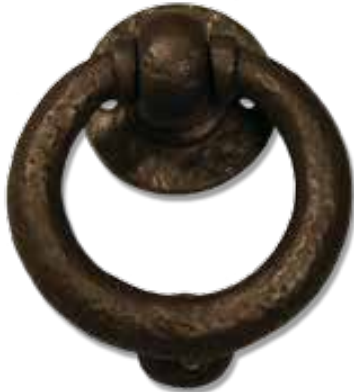
500-60 Door Knocker 3-1/2" x 4-1/4" Ring Diameter 3-1/2"