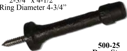
500-25 Door Stop 3-1/2"