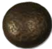
70-Small Mushroom Knob 2" 2-1/2" Proj.