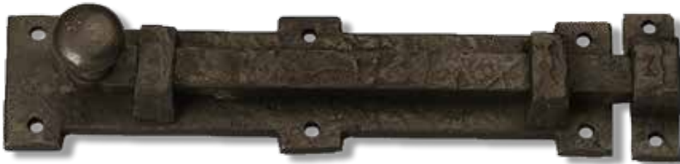
90-100 - Surface Slide Bolt 8" x 1-3/4"