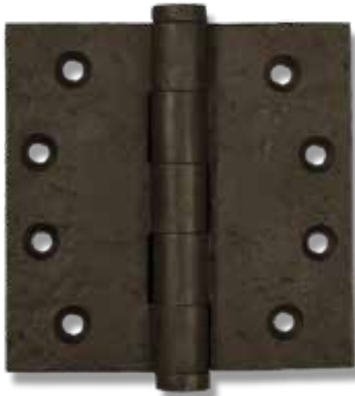
30-400 Button Tip 4" x 4"