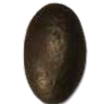
60-Oval Knob 2-1/2" x 1-1/2" 2-3/4" Proj.