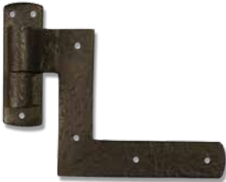
70-600 - 1-1/4" Offset 70-610 - 2-1/4" Offset New York Style 4 1/4" Tall x 6" Wide