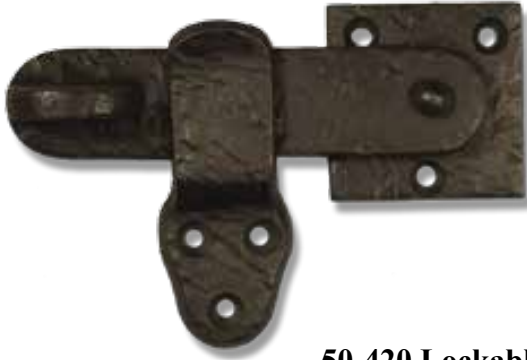
Plate 2" x 2" Drop Bar 4" Long