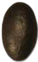
60-Oval Knob 2-1/2" x 1-1/2" 2-3/4" Proj.