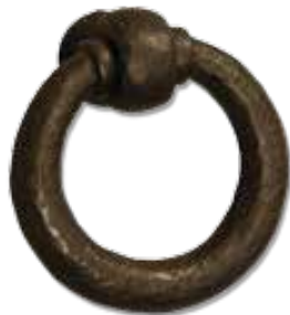
50-Ring 3-1/2" Diameter 2-1/4" Proj.