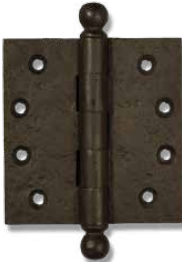
30-401 Ball Tip 4" x 4"

Hinges are casted and may vary slightly.