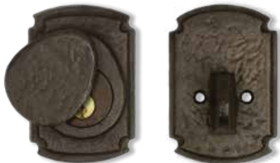
30-120 Deadbolt Euro 2-1/2" x 3"