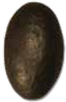
60-Oval Knob 2-1/2" x 1-1/2" 2-3/4" Proj.