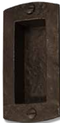
500-55 Arched Pocket Pull 4" x 2" x 1/2" Deep