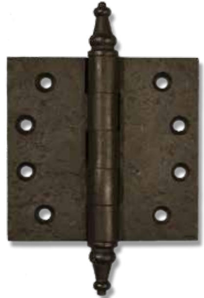
30-402 Steeple Tip 4" x 4"