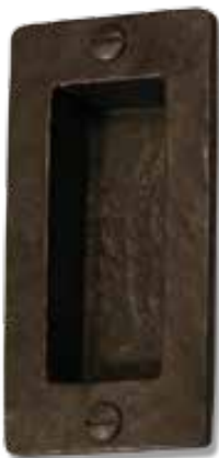
500-57 Square Pocket Pull 4" x 2" x 1/2" Deep