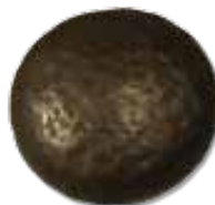
75-Large Mushroom Knob 2-1/4" 2-1/2" Proj.