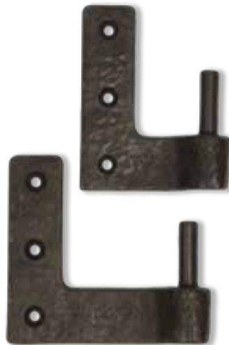
70-800 - 1-1/4" Offset 70-805 - 2-1/4" Offset Jam Mount Pintle Can be substituted for Pintle on Plate