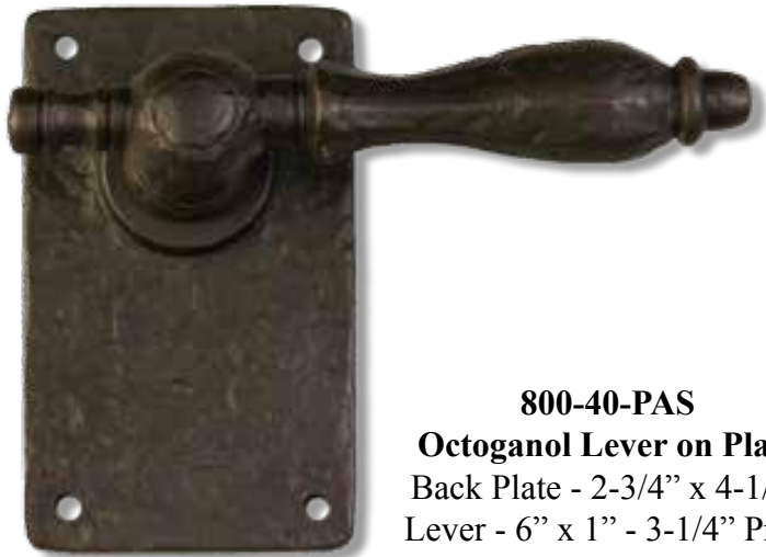
800-40-PAS Octoganol Lever on Plate Back Plate - 2-3/4" x 4-1/2" Lever - 6" x 1" - 3-1/4" Proj.