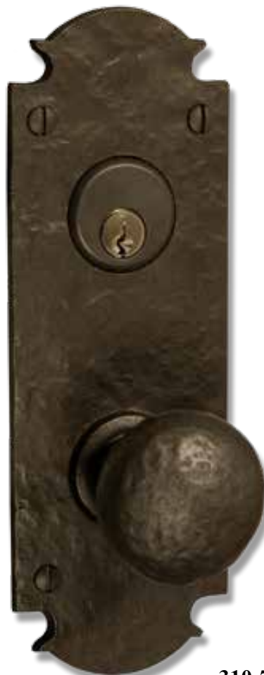
310-70-MOR Euro Mortise Entry Set 8" x 2-3/4"