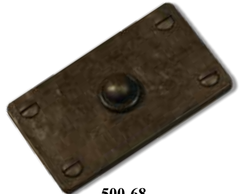
500-68 Square Door Bell 2" x 3-1/2"