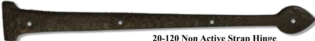
20-120 Non Active Strap Hinge