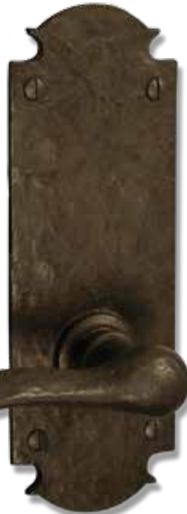
310-30-PAS Euro Passage Set 8" x 2-3/4" x 3/4"