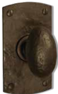
200-60-PAS Arch Passage Set 5" x 2-3/4"