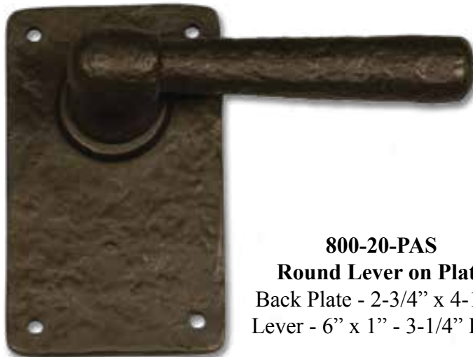
800-20-PAS Round Lever on Plate Back Plate - 2-3/4" x 4-1/2" Lever - 6" x 1" - 3-1/4" Proj.