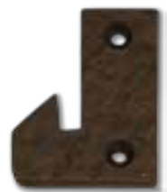
50-510 Reverse Bar Catch 1-7/8" x 2-3/8" 1/2" Thick