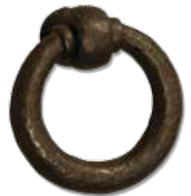
50-Ring 3-1/2" Diameter 2-1/4" Proj.