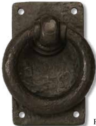
800-50-PAS Ring Turn on Plate Back Plate 2-3/4" x 4-1/2" Ring Diam. 3-1/2" - 2-1/4" Proj.