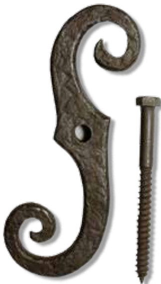
70-500 - Shutter Dog 7" x 2-1/2" Lag 4-1/2" Right and left hand available