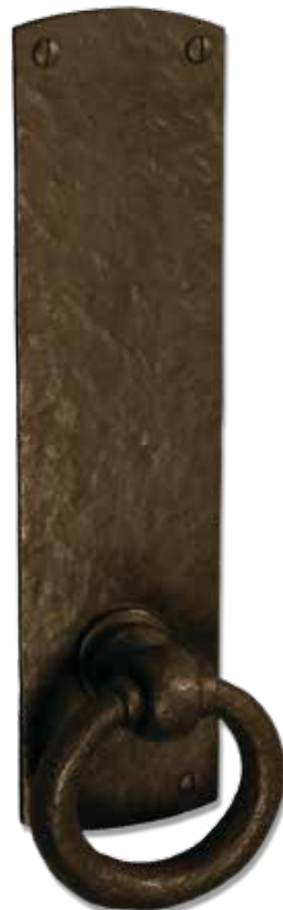
220-50-PAS Arch Passage Set 11" x 2-3/4"