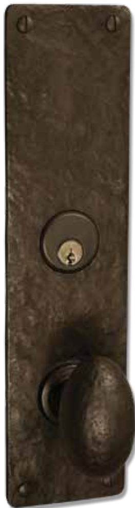
120-60-MOR Square Mortise Set 11" x 2-3/4"