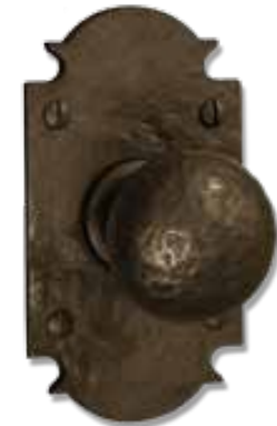
300-70-PAS Euro Passage Set 5" x 2-3/4"