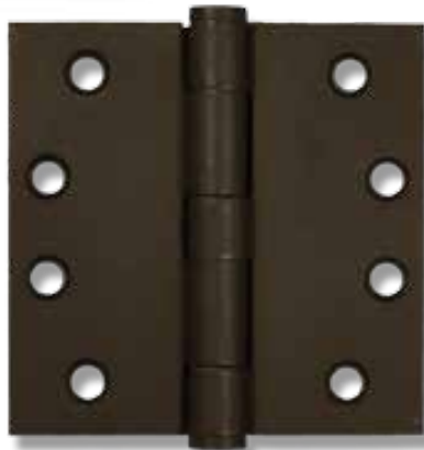
30-410 Template Hinge 4" x 4"