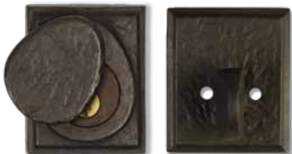
30-100 Deadbolt Square 2-1/2" x 3"