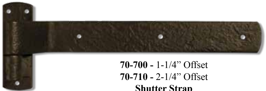
70-700 - 1-1/4" Offset 70-710 - 2-1/4" Offset Shutter Strap 1-1/4" Wide x 10" Long