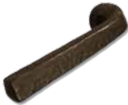
10-Square 4-3/4" Lever 2-1/2" Proj.

Case Latch is one side ONLY. Case Latch will work with any 1/2 dummy of any door hardware sets.