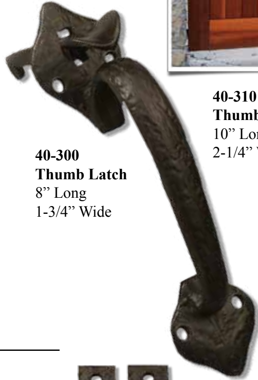
40-300 Thumb Latch 8" Long 1-3/4" Wide