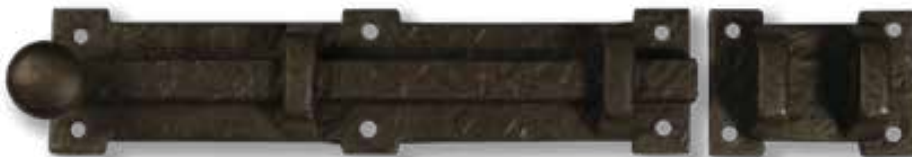
70-300 - Shutter Slide Bolt 6-1/2" x 1-1/2" Catch 2" x 1-1/2" Throw 2"