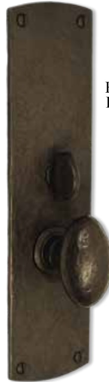
232-60-MOR Arch Mortise Set Exterior: 18" x 2-3/4" Interior: 11" x 2-3/4"