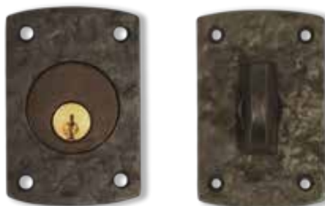
30-270 Patio Deadbolt Arch 30-251 Patio Bolt Arch 2" x 3"