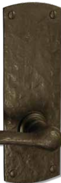
210-30-PAS Arch Passage Set 8" x 2-3/4"