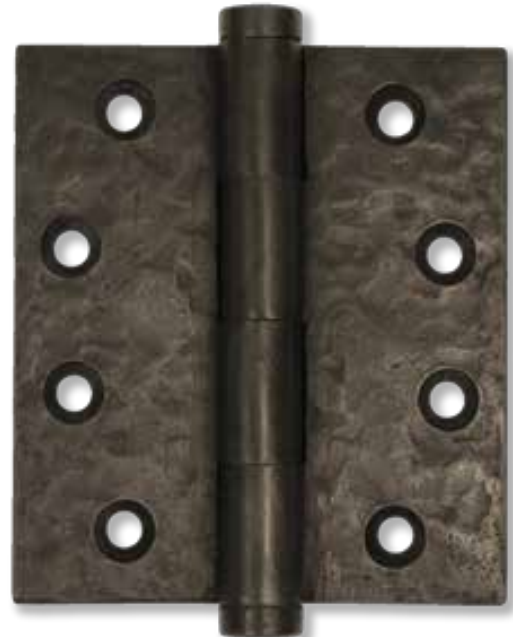
30-405 Button Tip 5" x 4-1/2"