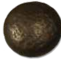
75-Large Mushroom Knob 2-1/4" 2-1/2" Proj.