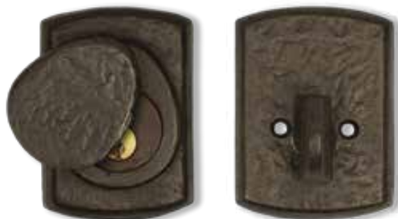
30-110 Deadbolt Arch 2-1/2" x 3"