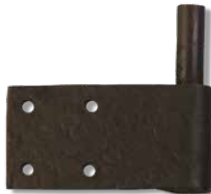
20-252 Jam Pintle Plate 2-1/2" x 4-3/4" - 1/4" Thick Right and Left Hand Available