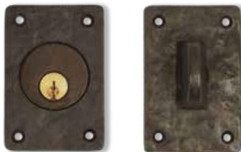
30-265 Patio Deadbolt Square 30-250 Patio Bolt Square 2" x 3"