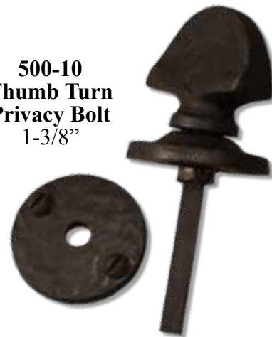
500-10 Thumb Turn Privacy Bolt 1-3/8"