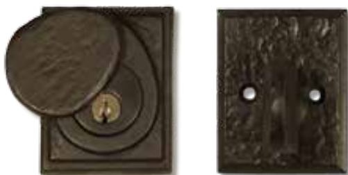
30-200 Deadbolt Square 2" x 2-1/2"

WARNING: Will Not Fit on Pre Cut Doors, Minimum Thickness 1-3/4"