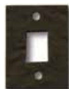
90-110 - Mortise Plate For 8" Slide Bolt